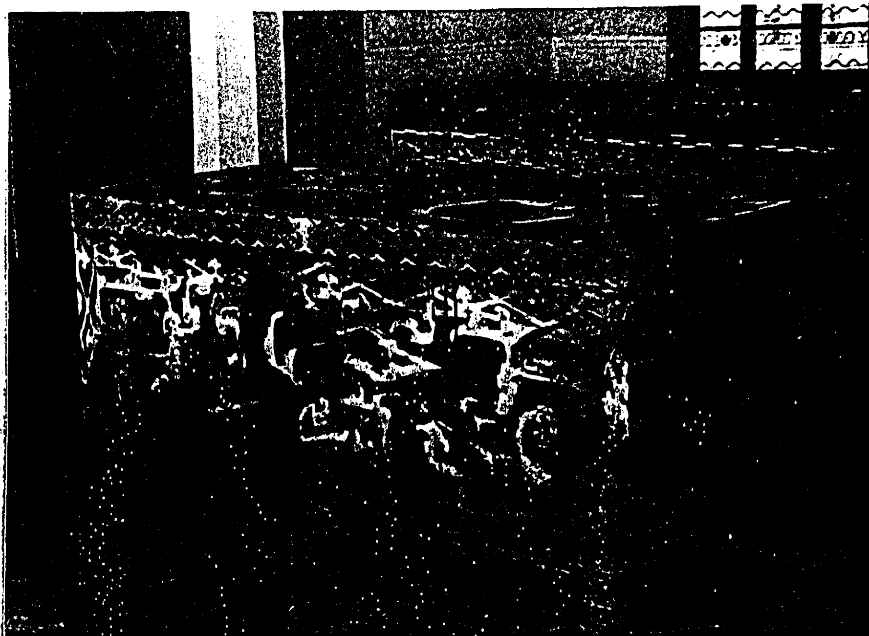
FIGURE 10: THE MIDDLE COFFIN WITH LACQUER PAINTING-(3)